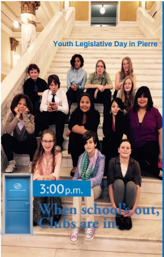
Youth Legislative Day in Pierre